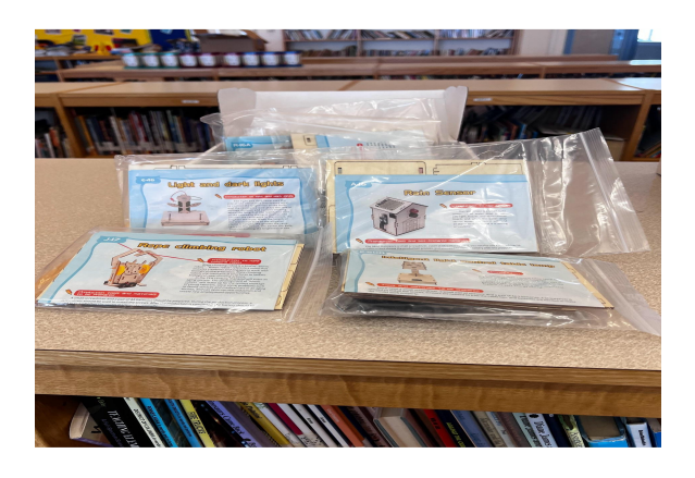
Add a caption for your picture.