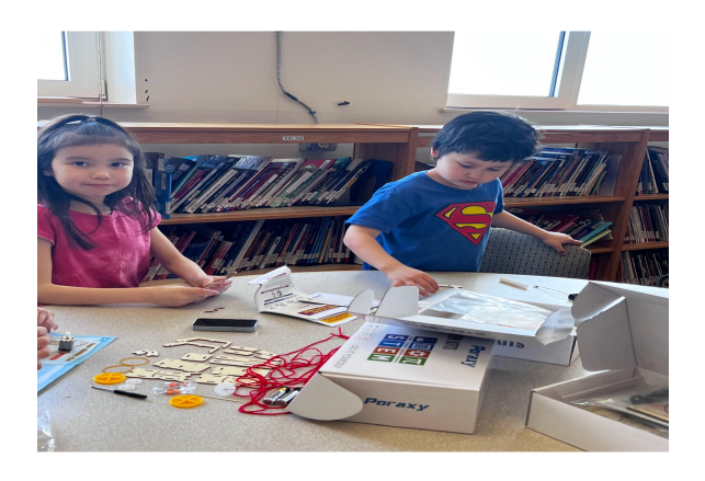
Add a caption for your picture.

Each student that came to family night, received their own box to keep. Students that were not at family night received a kit to take home after family night was over. Each family received an extra item to take home, depending upon the ages of the children. Younger students got to take home a Sea Monkey tank to watch their new pets hatch and swim around. Older students got crystals to take home and grow. Family night was a success both during and afterwards!